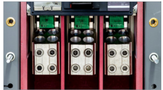
Temperature sensors can be read remotely without exposure to the line side conductors

Using Zigbee communication protocols, you can monitor main breaker operating temperatures on your wireless device. Schneider Electric's goal is to move away from reliance on PPE and administrative controls to more effective engineering controls and technology solutions.