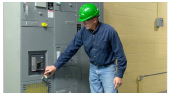
Reading the NFC (Near Field Communication Tag) on the equipment provides access to the mobile app while wearing minimal PPE