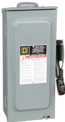
Heavy Duty Safety Switch