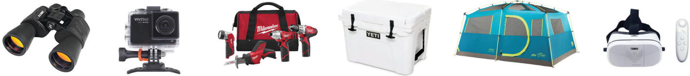
Just a few of the great rewards waiting to be redeemed through the Schneider Electric Contractor Rewards Program

Easily earn points by uploading your receipt via the mySchneider app to redeem your points for a variety of great items.