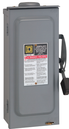
General Duty Safety Switch