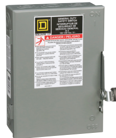
Light Duty Safety Switch