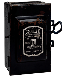
1909 era Square D enclosed safety switch

electrical safety, innovation, efficiency and continuity of power. Today, our innovative safety switches still meet the same essential needs: providing for the safe, reliable distribution and control of electricity.