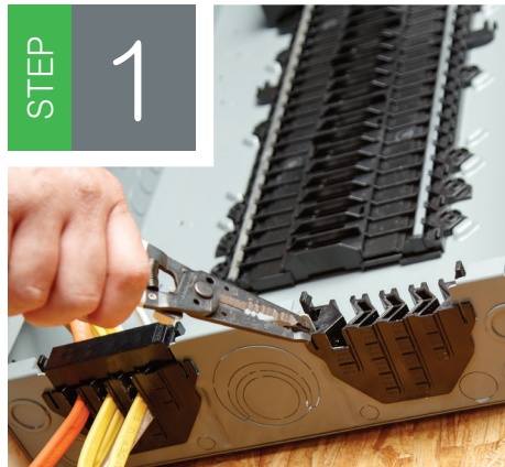
Remove the needed Qwiklet tabs