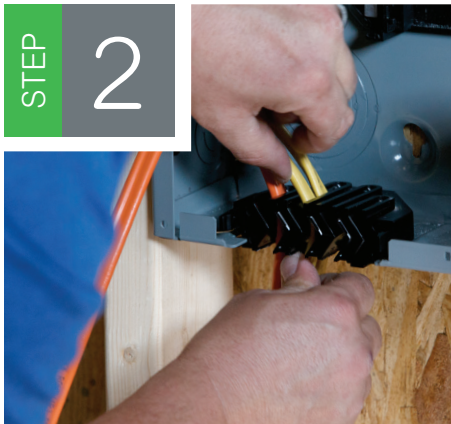
Slide the wire into the slot